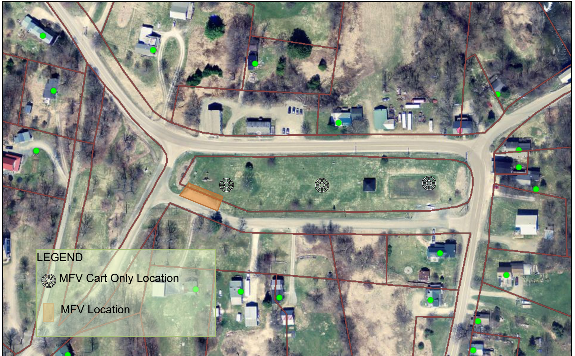
Exhibit A: Public Property Mobile Food Vendor (MFV) Locations