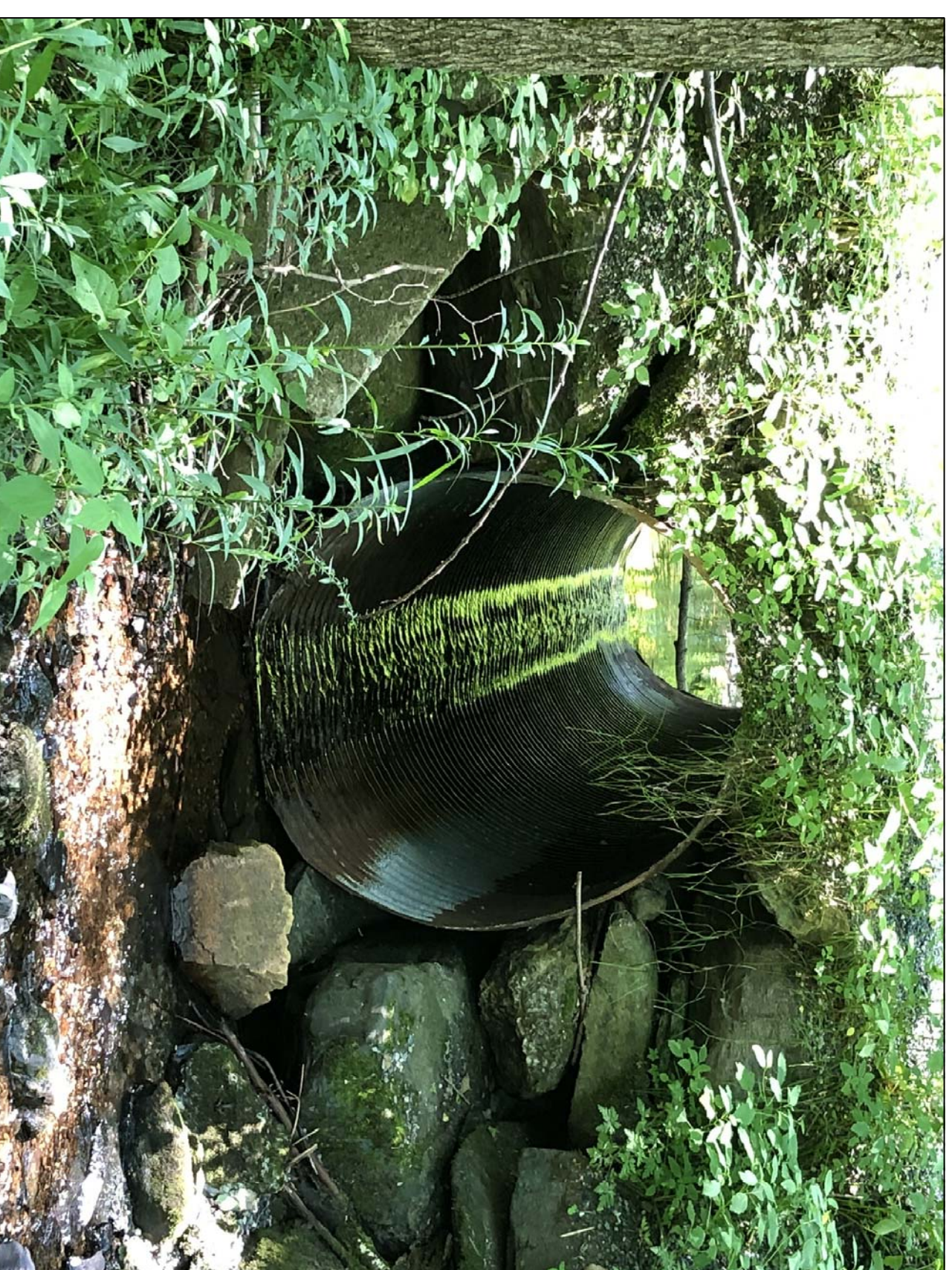
INLET END - EXISTING CULVERT