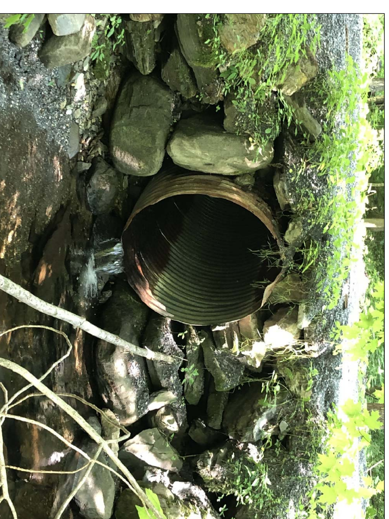
OUTLET END - EXISTING CULVERT