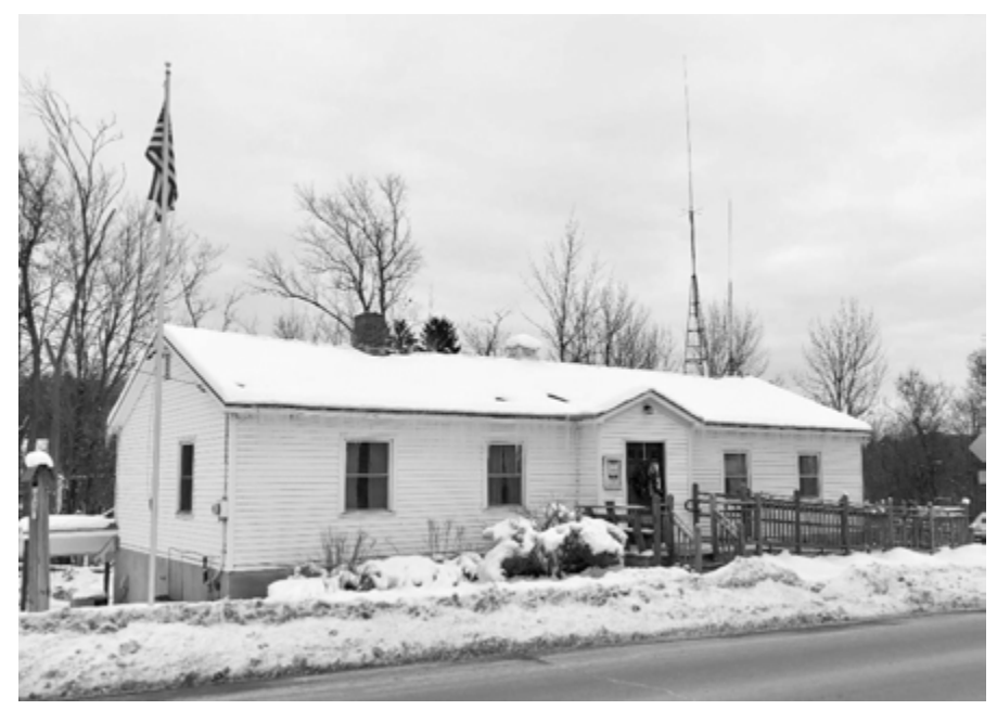
Westford Town Office