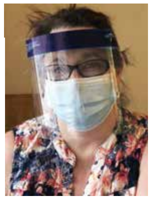
2020 ANNUAL REPORT July 1, 2019 – June 30, 2020