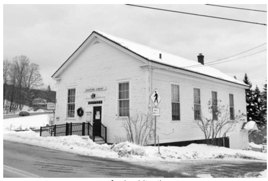
Westford Public Library