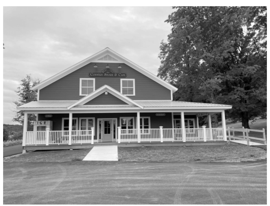
Westford Country Store & Café - opened September 2020 Constructed on the lot formerly owned by Norman Spiller

To learn more about the Vermont League of Cities and Towns, visit the VLCT website at vlct.org