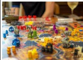
TABLE TOP GAME NIGHT March 21 from 6:30-8pm

Hosted by avid table top gamers Bill & Martha McClintock.